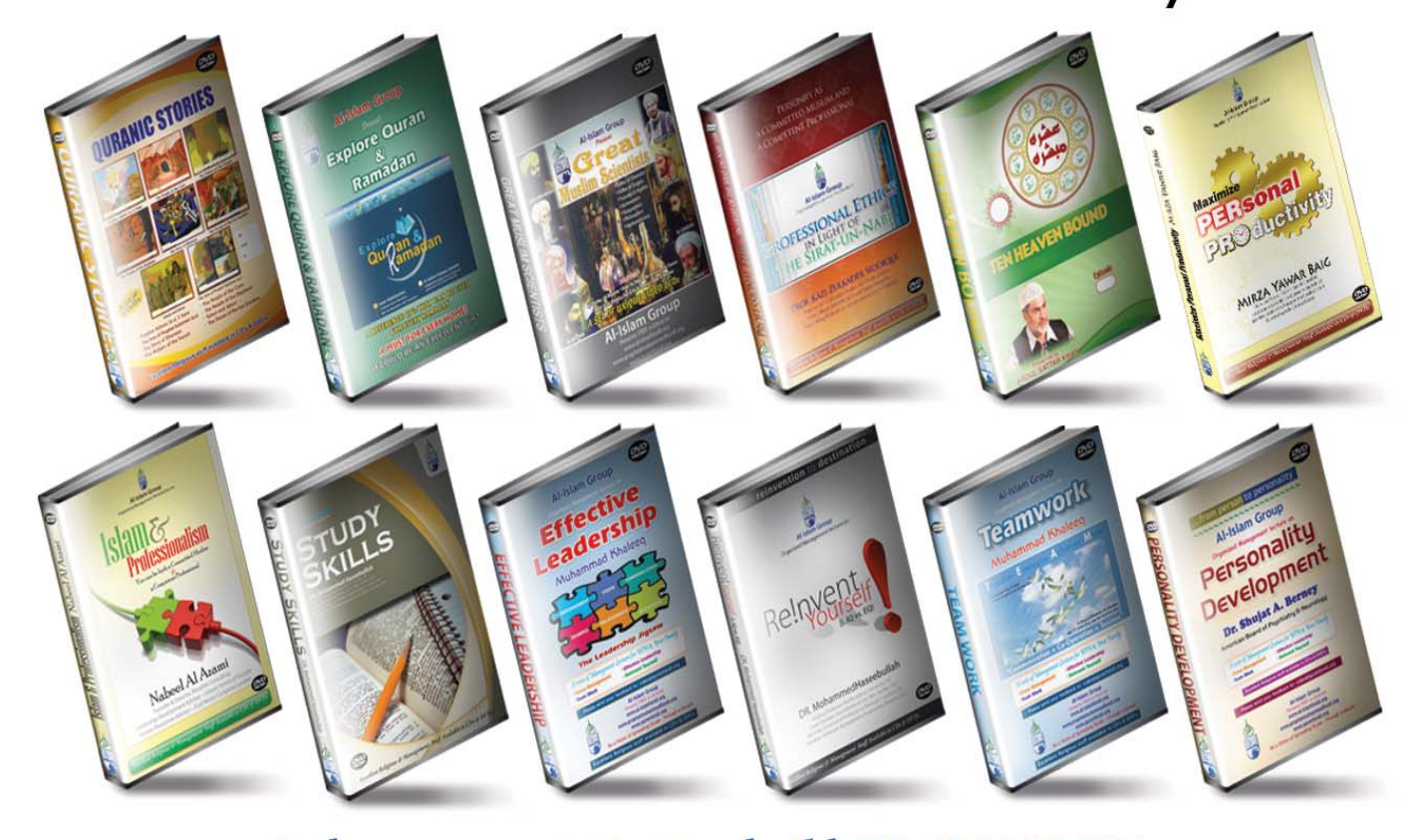
And many more topics to rebuild ISLAMIC LIFE...

Enjoy the Blissful Direction to Your LIFE! Excellent DVDs for YOU & YOUR Family