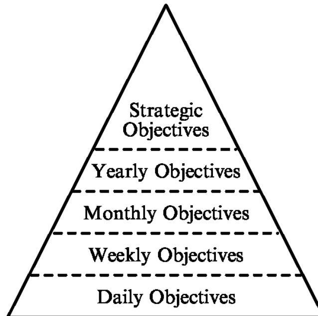
Figure (1): Pyramid of Objectives

Making a timetable for objectives is of great value when measuring efficiency and effectiveness of their achievement within the defined period. Activities within that period are to be arranged in accordance with priority of objectives or details so that objectives can be reached as scheduled.