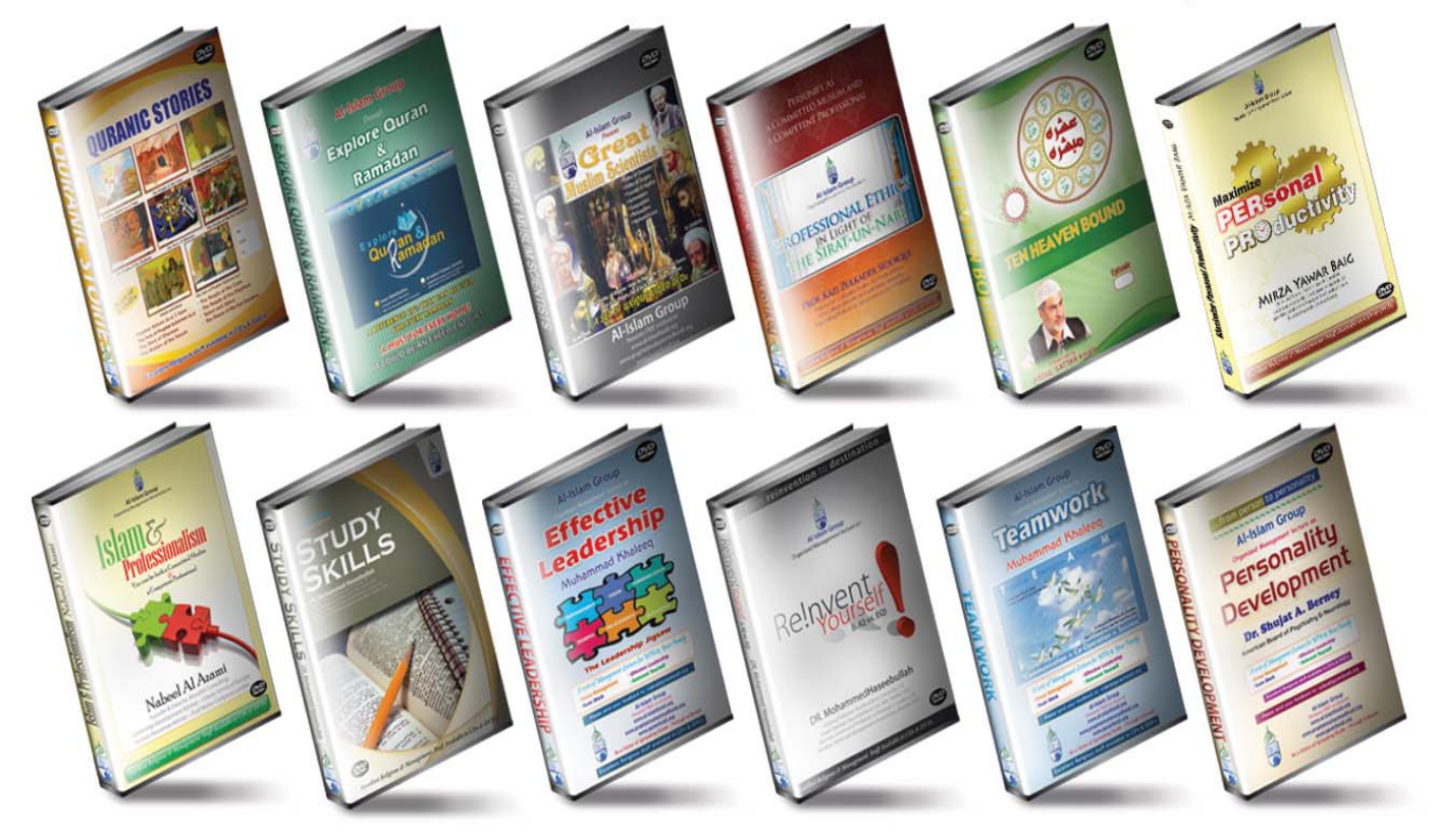
And many more topics to rebuild ISLAMIC LIFE...

Enjoy the Blissful Direction to Your LIFE! Excellent DVDs for YOU & YOUR Family