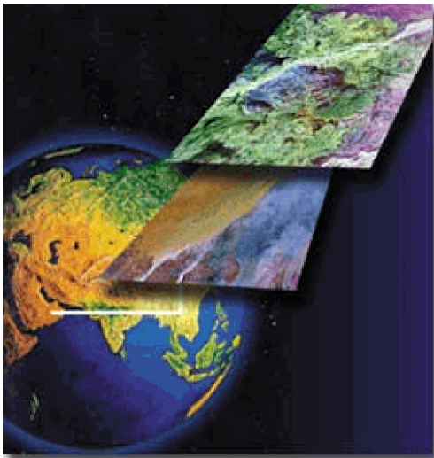
Fig. 3: The above satellite photographs show a section of Oman in the south of the Arabian Peninsula. In the photographs of the city of Ubar, viewed from space by NASA in 1992, were identified traces of ancient desert tracks. The people of 'Ad, revealed 1,400 years ago in the Qur'an, emerged as one of the miracles of the Qur'an through modern-day technology

Saba (City of Sheba) [10]: Saba is a city in Yemen which is mentioned in the Holy Qur'an as well, Allah says: "There was, for Saba, aforetime, a Sign in their homeland - two Gardens to the right and to the left" [11]. Saba was the period of the time of Prophet Solomon and Queen of Saba around the beginning of the first millennium BC and the story of Prophet Solomon and Queen of Saba was also mentioned in Holy Qur'an, Allah says "I have come to thee from Saba with tidings true, I found (there).