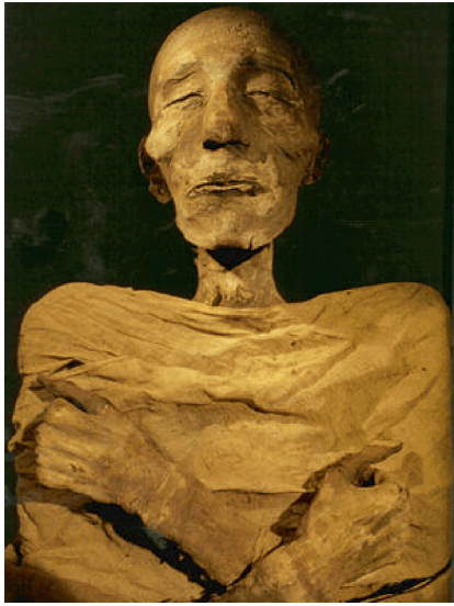
Fig. 12: Mummy of Merneptah (ca.1212 -1202 BCE), Exodus Pharaoh

Moses' Pharaoh's and Mummification [39] (Archaeological and Islamic Sources): Among the many hypotheses, concerning the historical time-frame occupied by the Exodus in the history of the pharaohs, I have concluded that the most likely is the theory which makes Merneptah [40], Ramesses II's [41] successor, the pharaoh of the Exodus. The comparison of the data contained in the Scriptures with archeological evidence strongly supports this hypothesis. I am pleased to be able to say that the Biblical narration contributes weighty evidence leading us to place Moses in the history of the pharaohs. Moses was probably born during the reign of Ramesses II. (Fig. 11) Biblical data are therefore of considerable historical value in the story of Moses. A medical study of the mummy of Merneptah (Fig. 12) has yielded further useful information on the possible causes of this pharaoh's death [42, 43]. The fact that we possess the mummy of this pharaoh is one of paramount importance. The Bible records that pharaoh was engulfed in the sea, but does not give any details as to what subsequently became of his corpse. The Qur'an, in Surah Yunus notes that the body of the pharaoh would be saved from the waters: "Today I will save your dead body so that you may be a sign for those who come after you" [44].