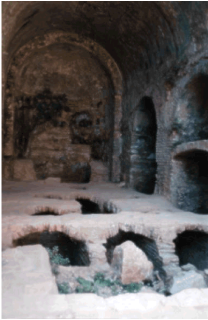
Fig. 8: View of Ashab Al Kahf in Ephesus Turkey