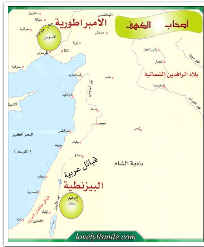
Fig. 7: Map shows the location of Ashab Al Kahf

The Archaeological Evidence: There are two views which referred to the location of Ashab Al- Kahf. Firstly, some allege that it is in Ephesus, Turkey. This is the common allege between the Muslim historian and interpreters whom a doubt the Christian story that the Ashab Al Kahf in Ephesus. On the slopes of Mount Pion (Mount Coelian) near Ephesus (near modern Selcuk in Turkey), the "grotto" of the Seven Sleepers with ruins of the church built over it was excavated in 1927-28. The excavation brought to light several hundred graves which were dated to the 5th and 6th centuries. Inscriptions dedicated to the Seven Sleepers were found on the walls of the church and in the graves. This "grotto" is still shown to tourists.