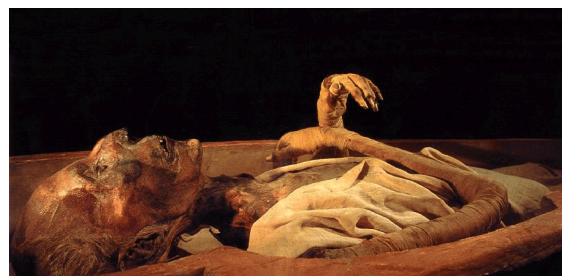
Fig. 11: The Mummy of Ramesses II (c. 1279- 1212 BC), Pharaoh of Moses, in the Egyptian Museum, Cairo