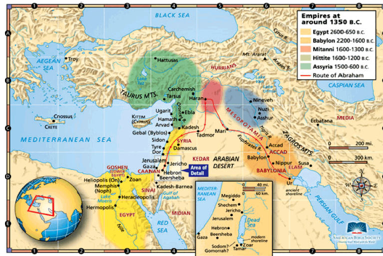
Fig. 1: Map shows the ancient Near East

archaeology. The Holy Book mentions various ancient places, Prophets, people and events that took place, although only a few of these have been uncovered by archaeology.