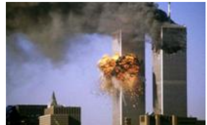
We were not allowed to ask "Why did this [9/11] occur?" but only "Why do they hate us?"

OI: Looking back to American Muslims before 9/11 and now, how would you assess their role in the American society?