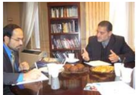
This is the message that we are trying to promote in the United States: look at the Muslim world as a partner, not as an enemy.

In other words, if the media is interested in learning about Islam and Muslims, there are many Muslim organizations, and we have, for example, [about 35] offices nationwide ready to be part of the story and to make it in the news. However, we cannot fix the perception that is wide and prevalent in the public. Through the media, we continue to be depicted only through the actions of the few. We are always being framed in the negative news that comes from Iraq, Afghanistan, Pakistan, and all these places.