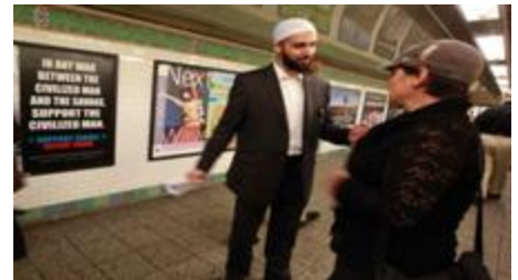
American Muslims are playing a critical role in preserving freedom and liberty for all Americans and preserving the values necessary for America to remain a free and just nation.

We also provided a credible source of information for the media and public who was eager to hear the Muslim voice on issues of importance and learn more about the Islamic faith. In light of increased Islamophobia and discrimination against Muslims since 9/11 organizations like CAIR helped the public realize that an assault on the freedom and liberty of American Muslims was in reality an assault on the liberty of all Americans.