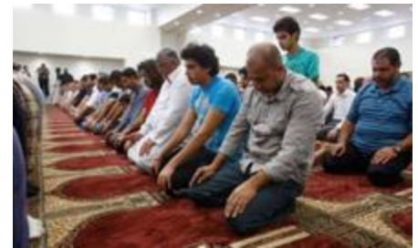
The diversity of Mosques is part of the mosaic of the US based religious institutions.