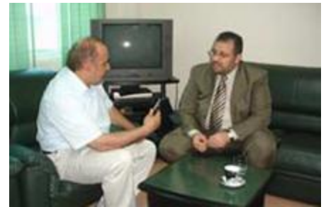
In the United States, there is no day without having someone going to a mosque to know about Islam.

So, America has always had good relations with the Muslim World, unfortunately in certain cases good relations did not exist. Both sides need to find a way to work with each other. So, I am very optimistic with the Obama Administration.